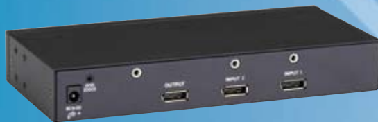
AVSW-DP2X1A (back view)

The diagram below shows the AVSW-DP4X1A connections.